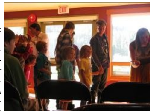
New grade one's are welcomed at the Rose Ceremony in September