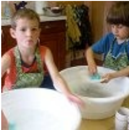
Washing up in the kindergarten!

During the day we have been singing songs about the orchard and we just started a Michaelmas story about a princess and a dragon. We have made apple muffins and we are looking forward to making crab apple jelly in a few days.