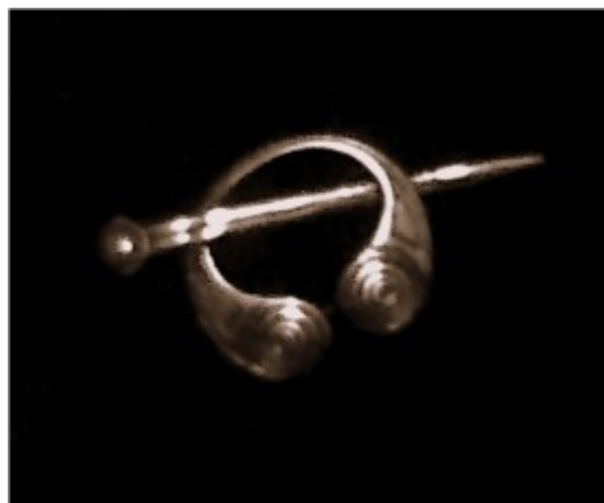
Lost and found brooch