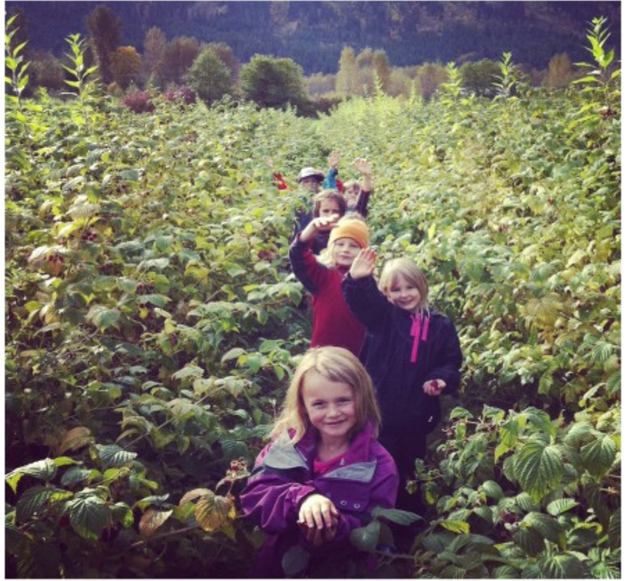
Grade 1 and 2 students picking raspberries at the farm—yum!

Happy Fall from Grade One and Two. We are enjoying everything that this season has to bring - autumn songs, finding many colors of leaves on nature walks, and a farm trip to North Arm to visit the pumpkin patch. While we were there we had a chance to eat corn right off the cob, pick our own pumpkin, feed the animals, and the children loved every second of picking tons and tons of fall raspberries. At the end of the day we came home with two cardboard flats of delicious berries that we made into a raspberry-apple crumble the next day. Another fun experience was making soup with the root vegetables that we got from the farm. We spent an afternoon preparing the veggies, and enjoyed eating the yummy fresh soup all together one Friday morning. We will be starting our first math block at the beginning of November and have already been practicing some simple adding and subtracting as well as new songs all about math. The class is looking forward to the upcoming lantern walk and will be making Martinmas lanterns during the next few craft periods.