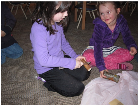
The Kindergarten children "carving" wooden candle holders

Our mission is to educate each child with reverence and respect; to nurture wonder, confidence and initiative, so they may participate in the world guided by a sense of truth and responsibility.